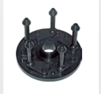
GAR132 Precision type clamping flange Universal, for wheels with 3/4/5 holes