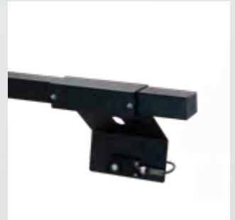
GAR373 Ultrasonic runout measuring device