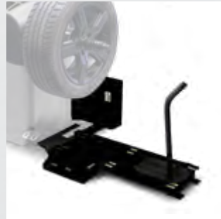
GAR324 Wheel lift with automatic compensation of wheel weight