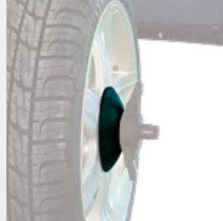
GAR121 Rim protection disk