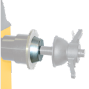
GAR112 Centering cone for off-road vehicles (Ø 95 – 132 mm)