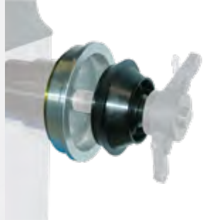
GAR113 Centering cone for vans and light trucks (Ø 118–174 mm)