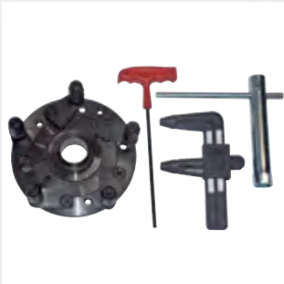
GAR131H Type clamping flange Universal