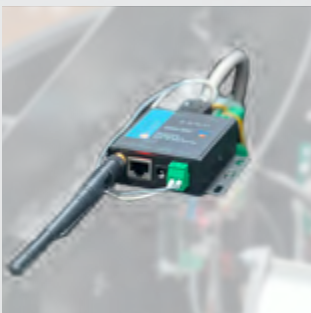
GAR378 Wi-Fi antenna, enabling connection feature