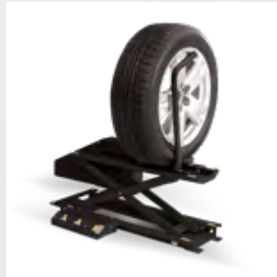
GAR325 Wheel lift Standard